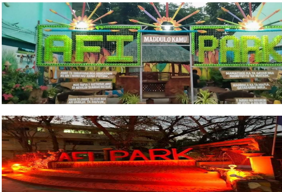
Figure 2. Afi Park in Schools in the Division of Tuguegarao City